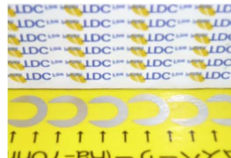
Surface Roughness Ra 80nm